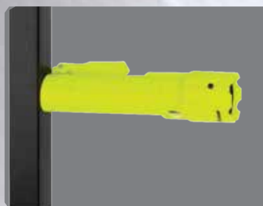
Hands-free magnet in base