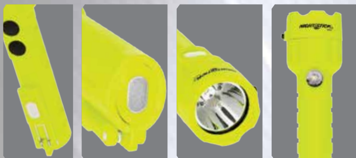
Built in pocket/ belt clip with integrated magnet

PESO Approval No : A/P/HQ/DL/104/5544 (P409850)