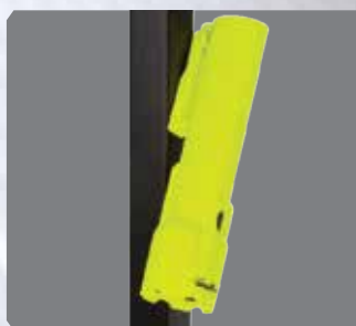
Hands-free magnet in pocket clip