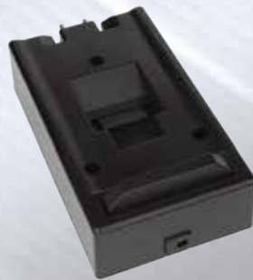
Wall or vehicle mounted charger