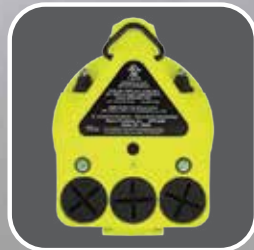
Rear-Facing Green Safety LED