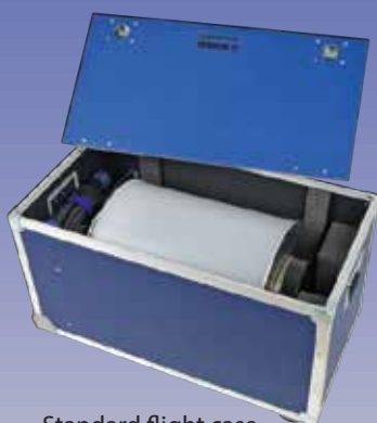
Standard flight case

The LUMAPHORE® LED 1000XL emits a powerful 129 000 lumens from less than 1000W of power, giving it one of the best lumen/watt ratios of around 129 Lm/w